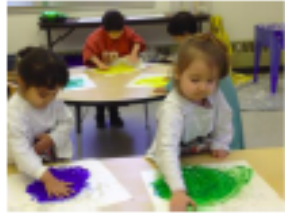
Painting the Picture of Wooch.een