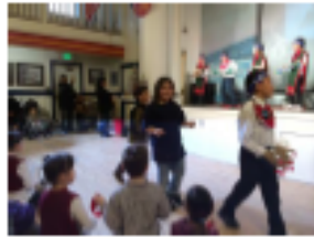
Wooch.een Yei Jigaxtooni We are Working Together